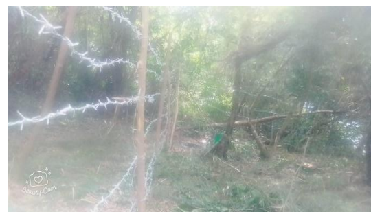
Perimeter fencing of the Calapan and Puerto Galera properties