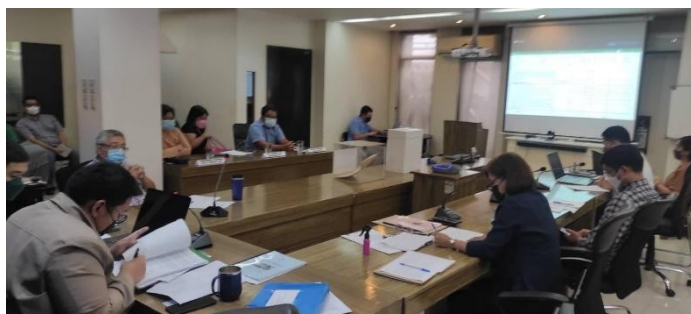
(Opening of bids of the EDSA property [above], and signing of the Deed of Sale [right])

The other properties, except BREDCO and BBC-Naga properties which are for re-appraisal due to expired valuations and changes in the zonal valuations, are pending rebidding after their public bidding failed.