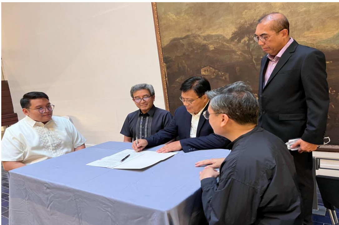
MOA Signing with UP Vargas Museum