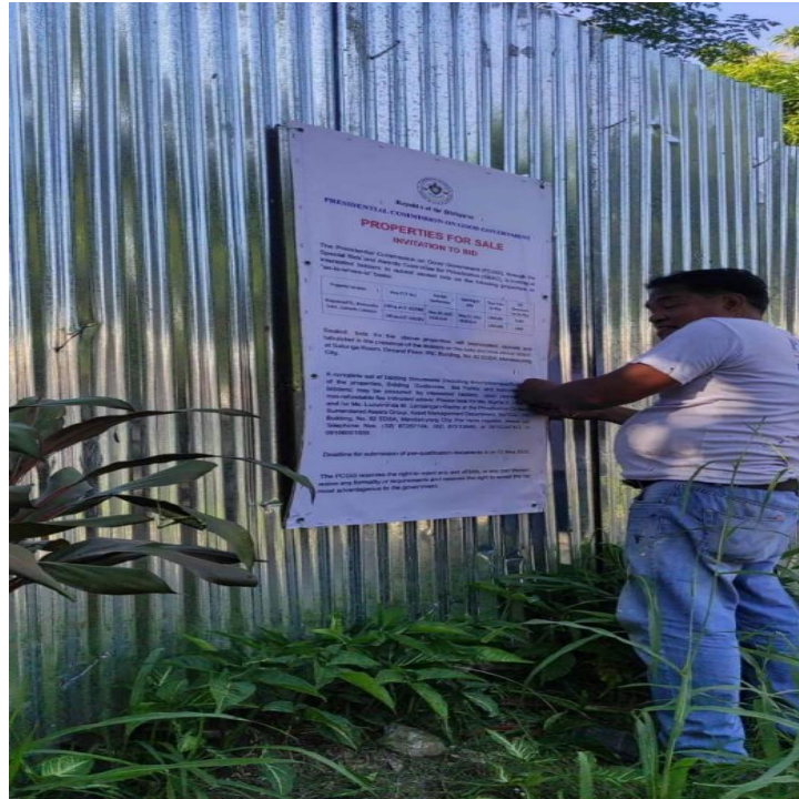
Posting of Notice of Sale and perimeter fencing of the Kingswood property

Latest technical documents of the abovementioned properties were likewise gathered for updated information.