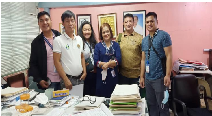
Gathering of latest technical documents of the BBC-Naga property at the City Assessor's Office, Naga City

Latest technical documents of the abovementioned properties were likewise gathered for updated information.