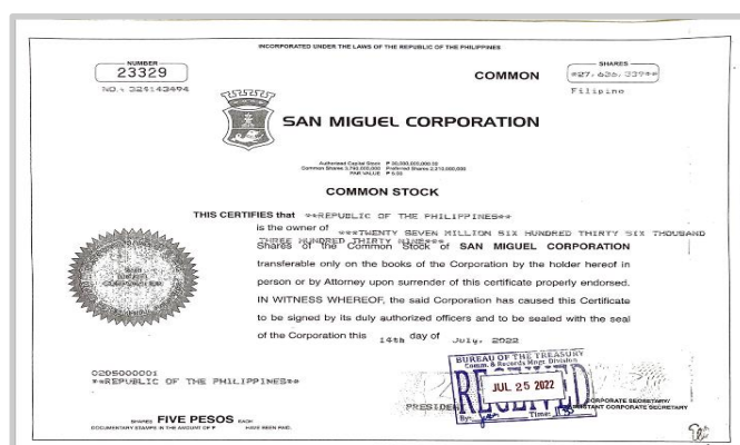
Copy of SMC Certificate No. 23329 for 27,636,339 common shares in the name of the Republic of the Philippines

In close coordination with the PCGG Legal Department, successfully transferred in the name of the Republic of the Philippines the 27,636,339 shares of stock of San Miguel Corporation (SMC) that were part of the recovered coco-levy assets. The Stock Certificate of these shares was delivered to the Bureau of Treasury (BTr) as Secretariat of the Trust Fund Management Committee (TFMC).