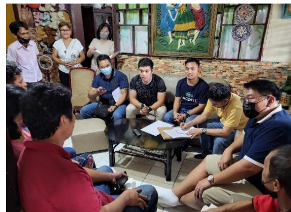
Meeting with Barangay officials and officers of different Homeowner's Associations in BREDCO property