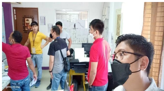
Gathering of latest technical documents of the Calapan property at the Register of Deeds, Calapan, Or. Mindoro