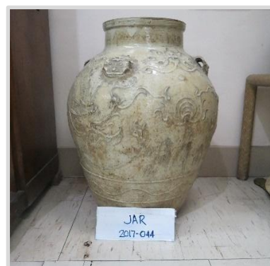
Some of the artworks now recorded in PCGG books.