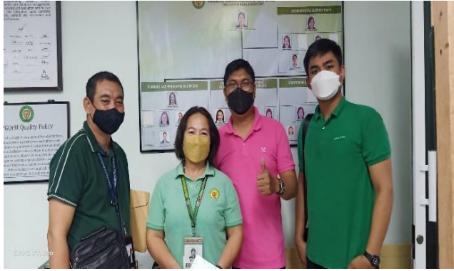
Gathering of latest technical documents of the Puerto Galera property at the Municipal Planning Office, Puerto Galera, Or. Mindoro