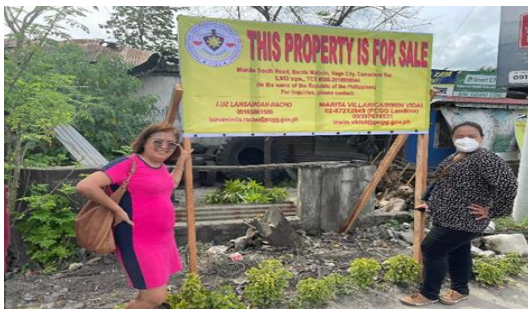
Inspection of the BBC-Naga property

On the other hand, the Philippine National Railways Corporation (PNR) was asked to explain the existence of PNR markers in the BBC-Naga property which, according to local residents, are for future PNR project.