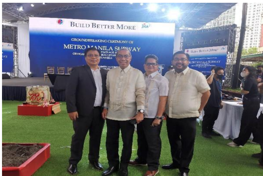
Groundbreaking ceremony of the Ortigas-Shaw Boulevard Station of the Metro Manila Subway Project on October 3, 2022, where Pres. Ferdinand R. Marcos, Jr. was the guest of honor. The area where a large portion of the station will be constructed is owned by MPLDC.