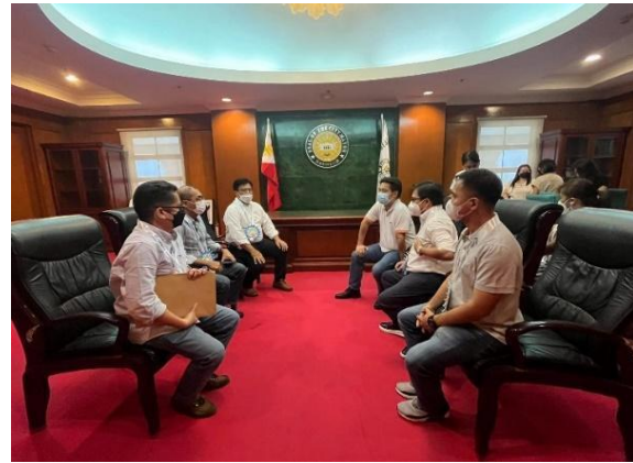
Meeting with Mayor Benitez of Bacolod City