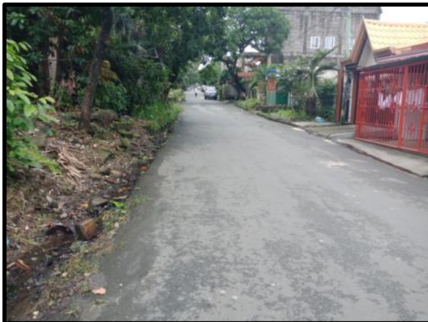
ROAD (KINGSWOOD STREET)